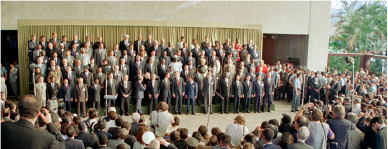
Heads of State and Government gathered for a group photograph at the 1992 Earth Summit in Rio de Janeiro, Brazil, as the media, delegates and staff members looked on.