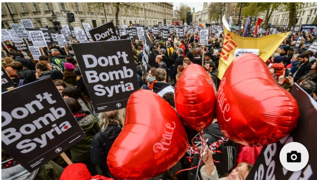
'Peace' balloons float up amongst 'Don't bomb Syria signs' outside Downing Street