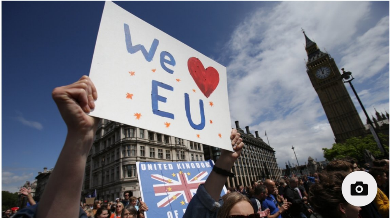
Protesters taking part in the event marched through London to Parliament Square