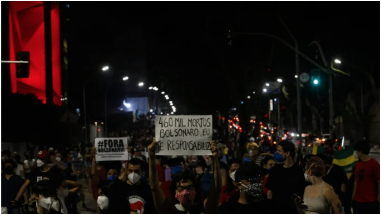
Demonstrators protest against President Jair Bolsonaro at Paulista avenue in Sao Paulo, Brazil

Tens of thousands of people in Brazil staged another day of protest against President Jair Bolsonaro, in particular for his chaotic handling of the pandemic, which has claimed nearly 460,000 lives there.