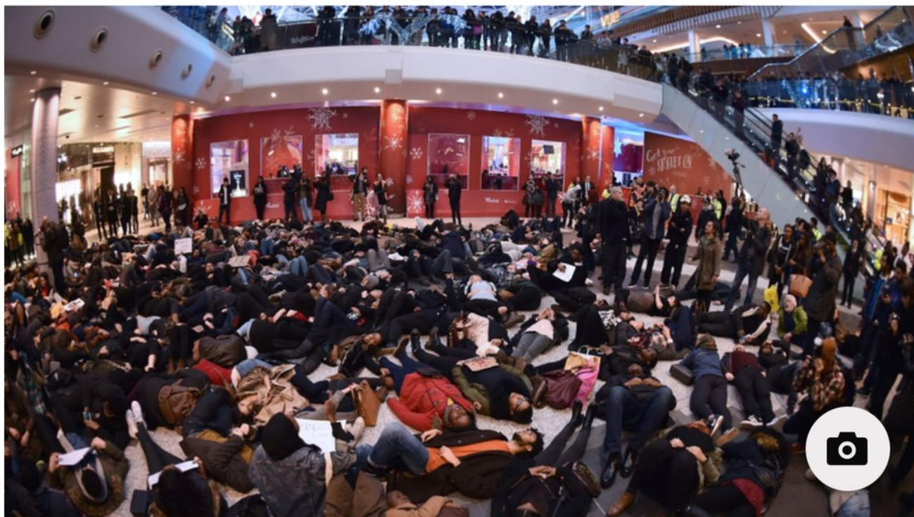
Demonstrators blocked the Westfield shopping centre by lying down on the floor

British authorities arrested 76 people at a mass "die-in" in