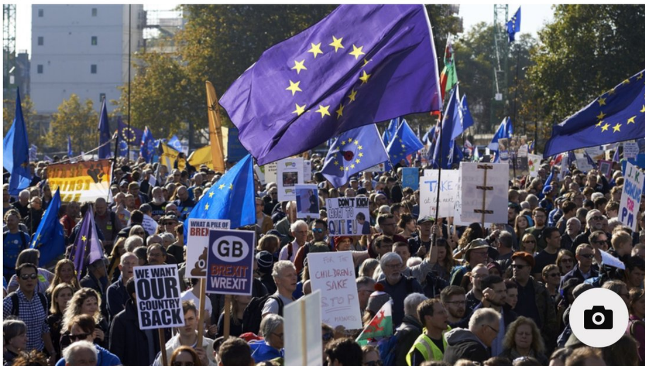
Organisers say up to 670,000 people attended today's march