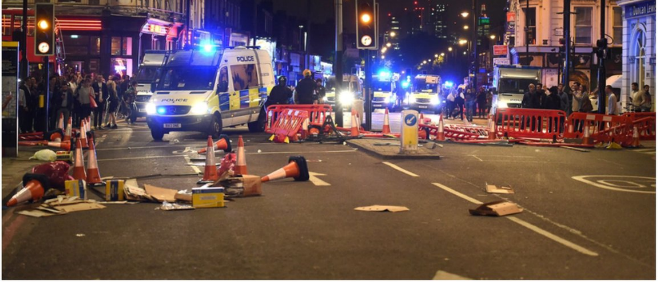
Police on horseback and some with riot gear were called to help clear the area in London