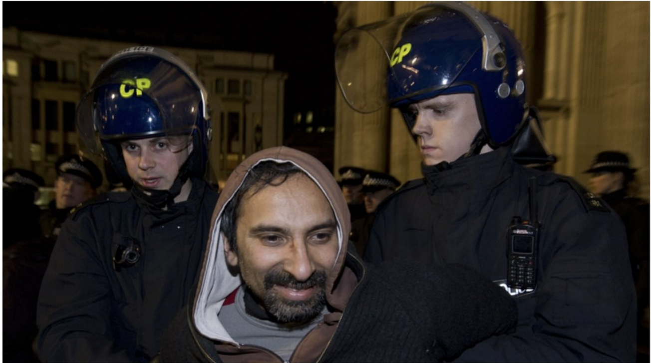
The evictions began just after midnight