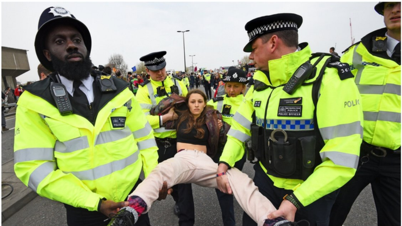
A protester is carried away by police

5. 🇺🇰 roll. May 29th 2021. It's the big one with hundreds of thousands of people attending in London. RTE finally did it, they covered the London protest.